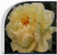
Bartzella (Anderson, 1986) 249$